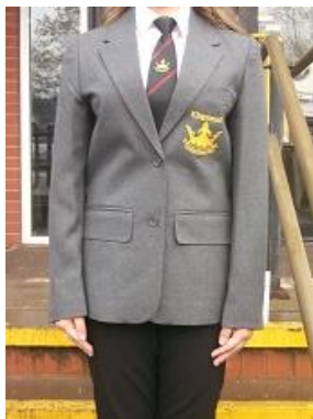
New Grey Blazer